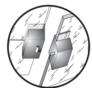
All measurements assume a 1/8" gap between door and frame.