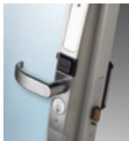
ADAMS RITE A100