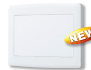
IXW-MA-SOFT-10 (10 IX-SOFT licenses)