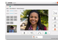
IXW-MA-SOFT PC Master Station Software via Multi-Purpose Adaptor