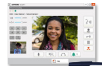
IX-SOFT PC Master Station Software via USB Dongle