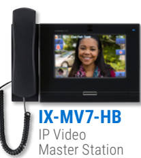
IX-MV7-HB IP Video Master Station (included with IXS-HBDV box set - available soon)