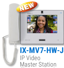
IX-MV7-HW-JP IP Video Master Station (TAA-compliant)