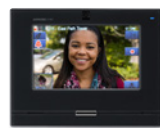
IX-MV7-B IP Video Master Station