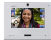
IX-MV7-W IP Video Master Station