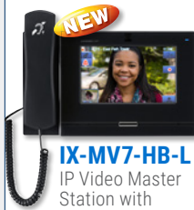
IX-MV7-HB-L IP Video Master Station with T-Coil Supported Handset